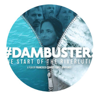
Movie screenings Dambusters Documentary

If you are unsure what to do for #WFMD2024 you can always contact us: info@fishmigration.org or adela@fishmigration.org