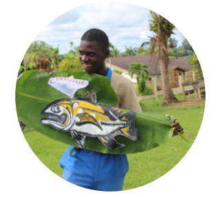
Making Art Fish Flag Contest -Gabon