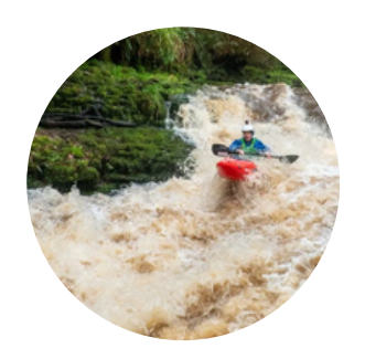
Athlete Challenge France