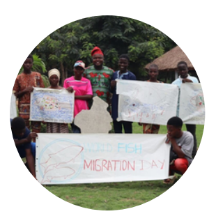
School Activities Benin 2020