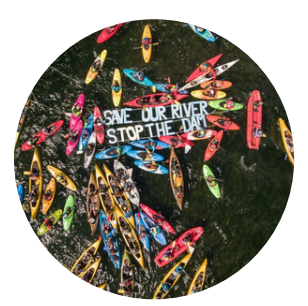
Kayaker gatherings Save the Blue Heart of Europe