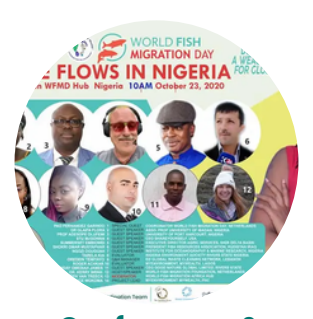
Conferences & Workshops Nigeria